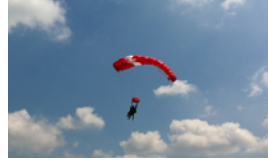
MICHAEL'S HIGH FLYING ADVENTURE