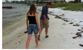
GEOCACHING ON THE BEACH