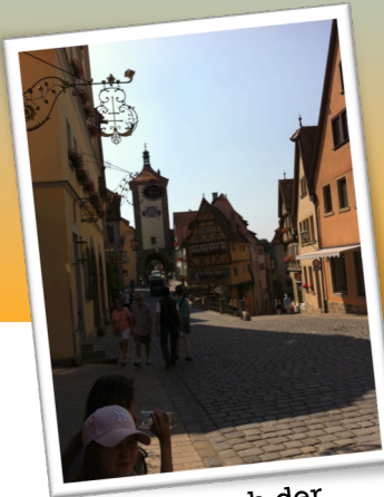
Rothenburg ob der Tauber, Germany