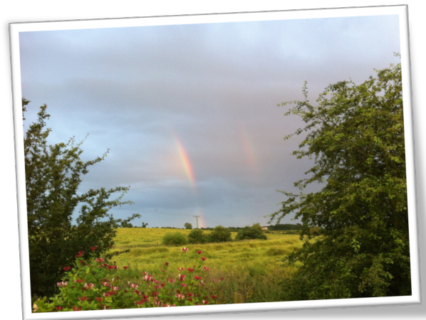
It always seems to be raining and sunny, in exchange we see a lot of rainbows.

This summer we hope to return to the States for a visit. Details still need to be worked out, but we are looking at end of July and into August. We hope you are well and are enjoying your own adventures no matter how close to home they are!