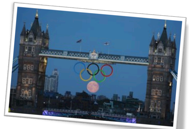
2012 London Olympics